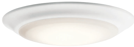
GEN 1 Polycarbonate Diffuser

43848 NILED30, NILED30T 43848 OZLED30, OZLED30T 43848 WHLED30, WHLED30T, WHLED30TB