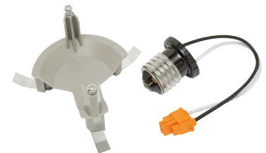
Retrofit Kit for 43878