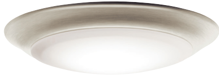
GEN 2 Polycarbonate Diffuser

Retrofit kit available for installation over existing recessed housings